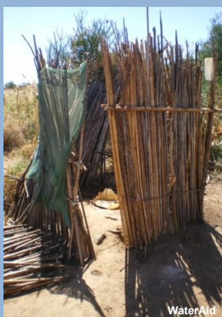
Unimproved pit latrine (slab is not washable)