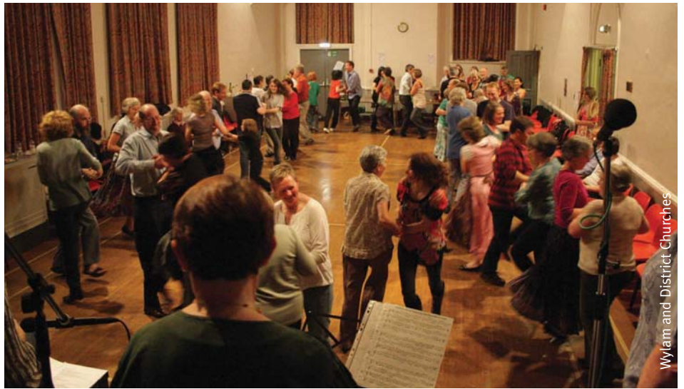
The Big National Ceilidh 2008 raised over £40,000 for WaterAid!

On Saturday 18 October 2008 over 10,000 people put on their dancing shoes and took part in the first ever Big National Ceilidh for WaterAid. Following this overwhelming success we are delighted to announce that this year's event will take place on October 17. Ceilidhs (or barn dances) are wonderful social events and appeal to all ages. To find out more and to register for a free fundraising pack visit www.wateraid.org/ceilidh