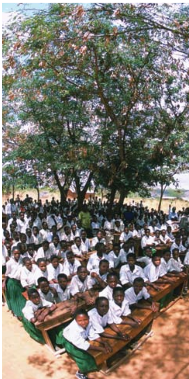
A lesson under the trees at Kashishi Primary School, Tabora, Tanzania

For a free fundraising and information pack please email rotary@wateraid.org