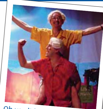
Oh yes it is! – the WaterAid pantomime in action.

By making WaterAid a chosen charity, schools and companies can raise funds to change lives.