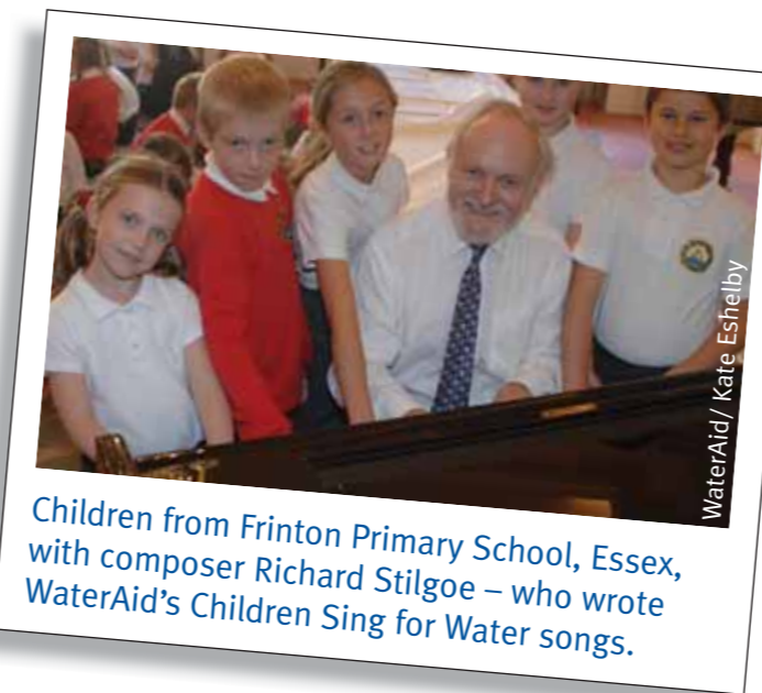
Children from Frinton Primary School, Essex, with composer Richard Stilgoe – who wrote WaterAid's Children Sing for Water songs.

There are lots of ways you can get involved, from taking part in our sponsored singing activity Sing for Water to forming your own local fundraising group. Visit www.wateraid.org/community to find out more.