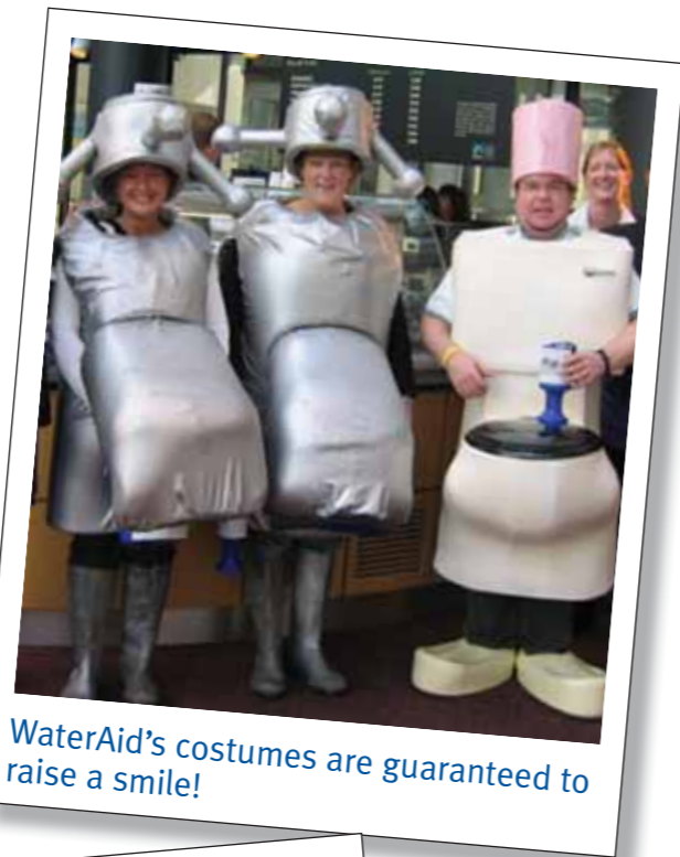
WaterAid's costumes are guaranteed to raise a smile!