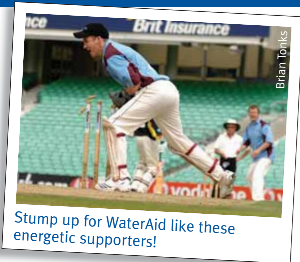
Stump up for WaterAid like these energetic supporters!