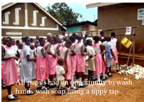
All pupils had an opportunity to wash hands with soap using a tippy tap