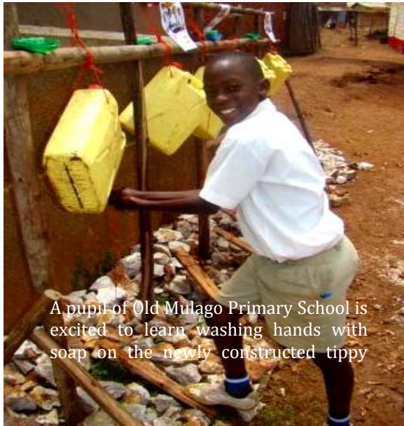
A pupil of Old Mulago Primary School is excited to learn washing hands with soap on the newly constructed tippy