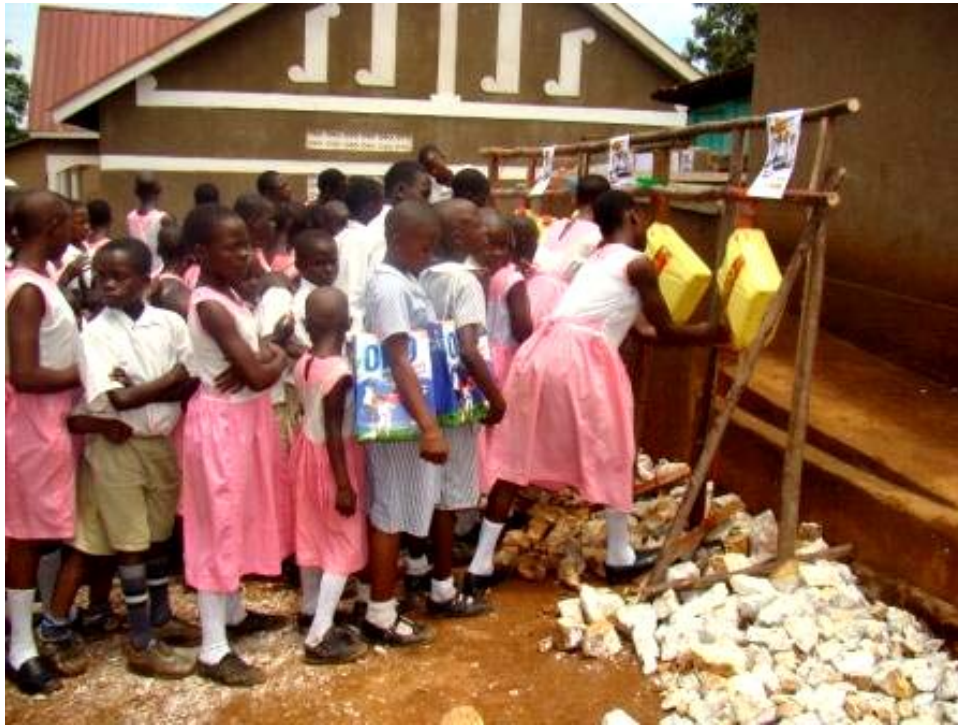
Every pupil present had to learn how to use a tippy taps while washing hand with soap

T o the pupils of Old Mulago and St. Bernadette Primary Schools, 15 th October 2009 was not like any other ordinary school day- it was Global Handwashing Day. A day designated by the United Nations to raise greater awareness to the fact that washing hands with soap at critical times, particularly after using a toilet or a pit latrine (as is the case in most parts of Uganda) and before eating or feeding a child, has far-reaching positive effects in terms of child survival, development and poverty reduction. Normal school lessons were cut short, and tents erected in Old Mulago Primary School compound served as a meeting point for the event. Early morning pupils