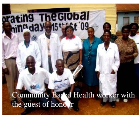
Community Based Health worker with the guest of honour