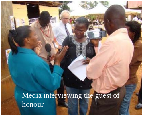
Media interviewing the guest of honour

By 2:00pm the Global Handwashing Day programme in the two schools came to an end, ushering in a new beginning for concrete action to stimulate behaviour change in favour of handwashing with soap at critical times in all schools and families as a remedy to ill health leading to poor performance in class and poverty in many households in Uganda.