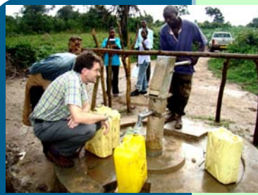
The CR inspecting works done by partners . Below a truck drilling a bore hole in Amuria District.