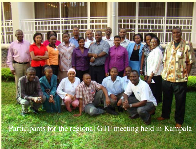
Participants for the regional GTF meeting held in Kampala

October 24-26 2009, WaterAid Uganda hosted the East African GTF regional meeting in Kampala. Participants came from Kenya, Malawi, Zambia, Ethiopia and Uganda the host. The meeting aimed at reflecting on the regional GTF programme after one year of implementation by partners, share experiences and lessons - thereby improving programme delivery, developing learning mechanisms and preparing for the big meeting of all GTF country pro-