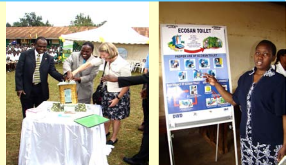
Left picture in the middle, State Minister of Water and Environment launching the Ecosan Resource centre—Right WA staff demonstrating how ecological sanitation works

As part of activities to commemorate World Toilet Day, WAU participated in the launch of the Ecosan Knowledge Node on the 17 th October 2009 at St. James Biina Primary School in Kampala. The Ecosan node (resource centre) is hosted by Network for Water and Sanitation (NETWAS) Uganda and it aims at closing the knowledge gap, influencing attitudes, research and demonstrates sustainable sanitation promotion approaches and technology options in the country.