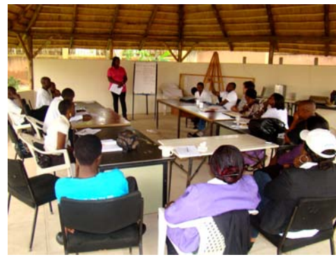
WAU staff learning how to integrate children's rights in the implementation of WASH projects.

environment should never be a punishment. It was also agreed that the starting point of streamlining children's rights in the WASH sector is to have in mind "the best interest of the child" as the guiding principle in the delivery of WASH services. While on the other hand, children's voices must also be listened to in the delivery of water, hygiene and sanitation services.