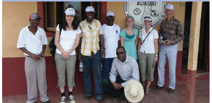
MCFEA Trustees meet Adasbu – one of WaterAid's partners in Maputo, Mozambique.

Since 2003 the MCFEA has supported WaterAid's work in Mozambique. To date, they have donated more than £200,000. This ongoing substantial support enables vital water and sanitation projects to take place in Mozambique's capital city, Maputo.