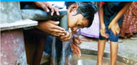
↑ The local community now has clean and safe water.