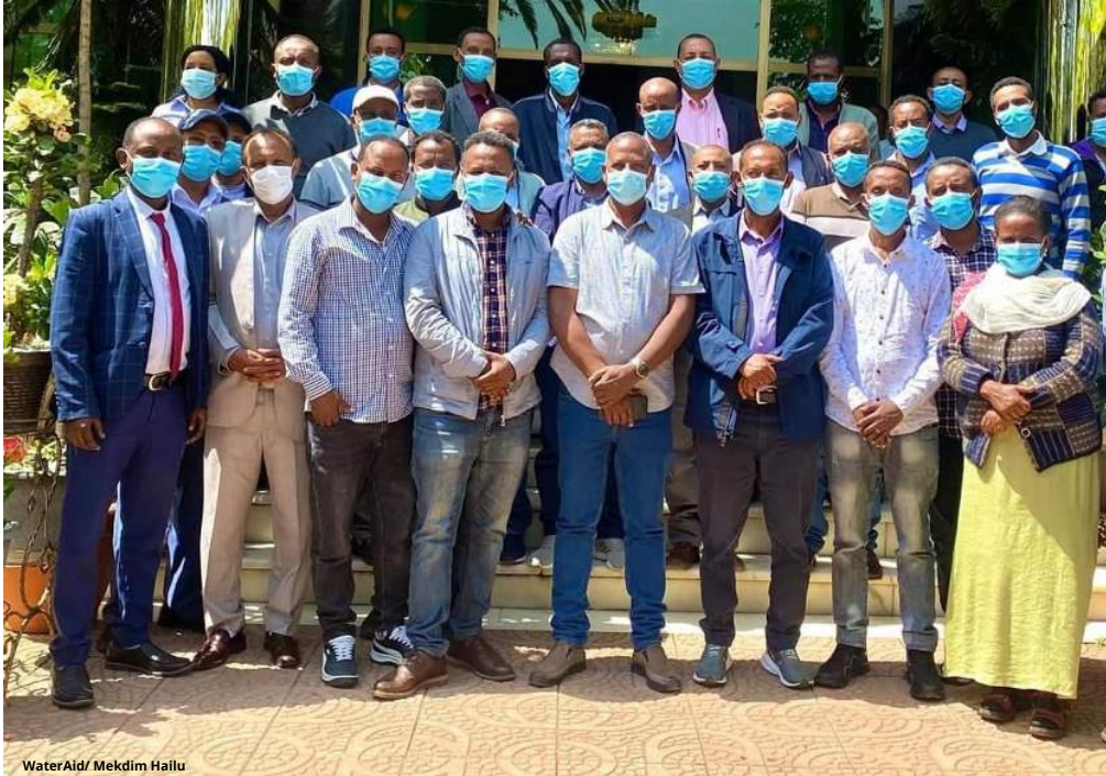
Attendees of the Phase II: The Cluster Approach Project regional workshop

With over 1,000 towns across the country, and an urban population set to double in size every fifteen years, Ethiopia is faced with considerable challenges in ensuring adequate and inclusive WASH services in urban areas.