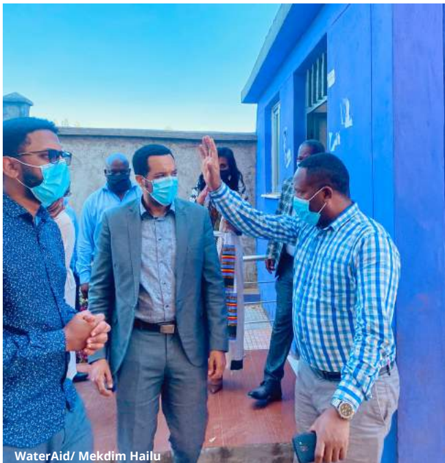
State Minister of Health Dr Dereja Duguma visits WASH facilities built by WaterAid Ethiopia at the GHWD event.

The celebration featured a demonstration of handwashing, a performance by Filfilu, one of the most popular comedians in the country, and an appearance by a widely known children's character, Ethiopis. At the end of the event, a delegation of guests including the State Minister visited the WASH facilities at the school which are constructed by WaterAid Ethiopia to serve more than 500 students.