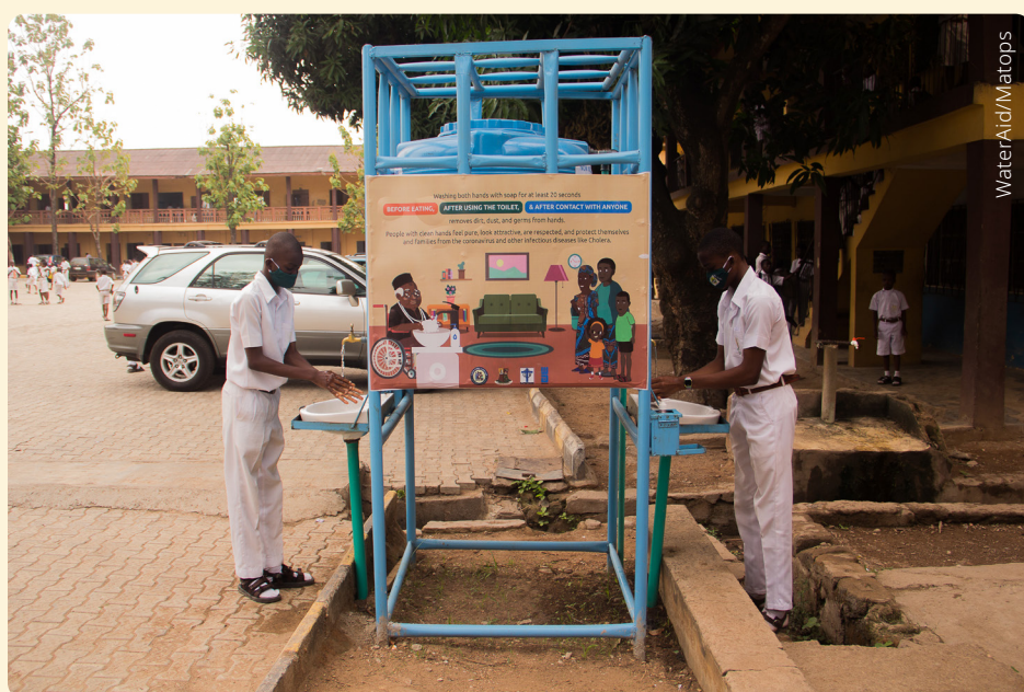
Two students of in a High School in Oyo State, wash their hands at a handwashing station provided in their school by WaterAid, with funding from Hieneken Africa Foundation, to improve hygiene behaviour, March 2022.

We will support functional coordinating platforms for WASH and climate change, review existing WASH policies to integrate climate change at National and State level and also integrate climate change policies into WASH.