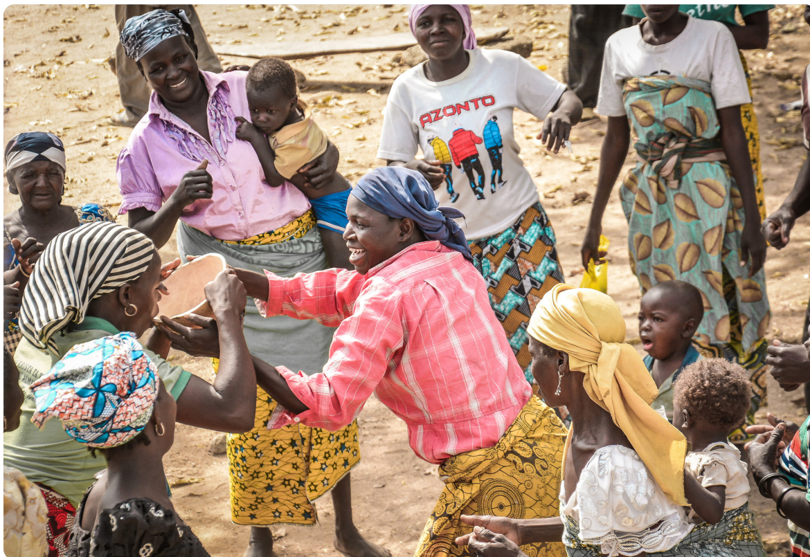
Women celebrate access to clean water provided by WaterAid.

Climate finance offers a huge but currently underdeveloped funding opportunity for WASH. A larger percentage of funding globally by donors has shifted to climate change, but without a focus on WASH. WASH in climate adaptation plans, and climate considerations in WASH plans is still lagging. We will leverage these opportunities to address negative impact of climate change by ensuring WASH solutions are more climate resilient