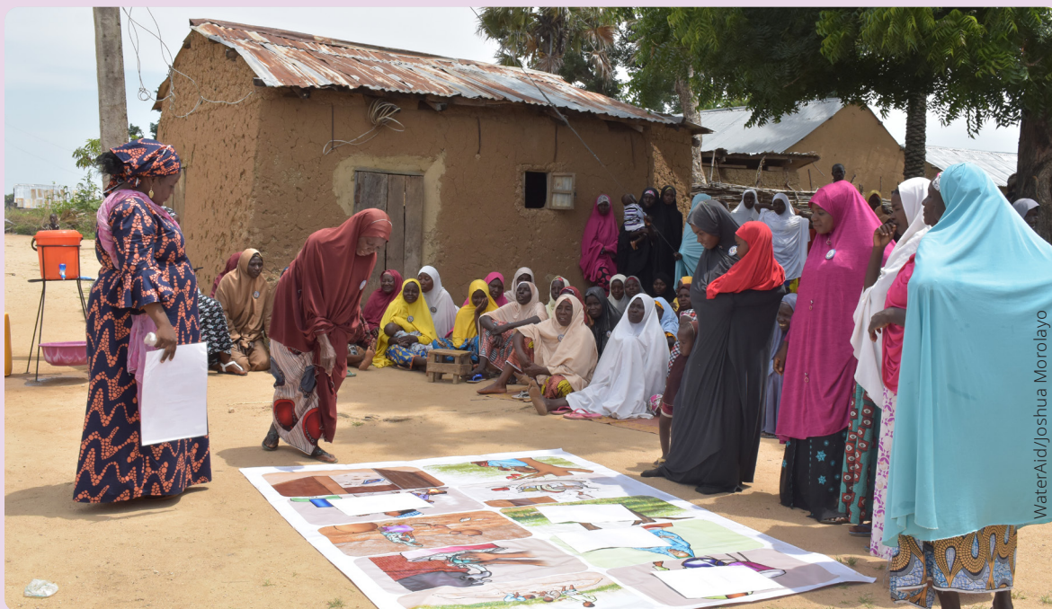
Community members participate in a game during a hygiene behaviour change campaign in a community in Bauchi State, 2023.