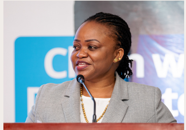
Hon. MaryPrisca Mahundi, Deputy Minister for the Ministry of Water

I commend WaterAid Tanzania and thank them for their good work and for preparing their new strategy for the years 2023-2028.