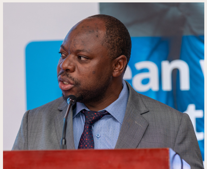
Hon. Albert Chalamila, Regional Commissioner, Dar Es Salaam

We have a few requests that we can all digest, Dar Es Salaam is challenged with floods when it rains heavily, we have discussed with TANROADS to have a bigger drainage system but at the same time, we are also trying to get means of harvesting all the rainwater so that we can contain water from rain.