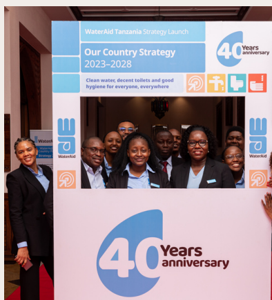
WaterAid staff posing on the WASH selfie frame