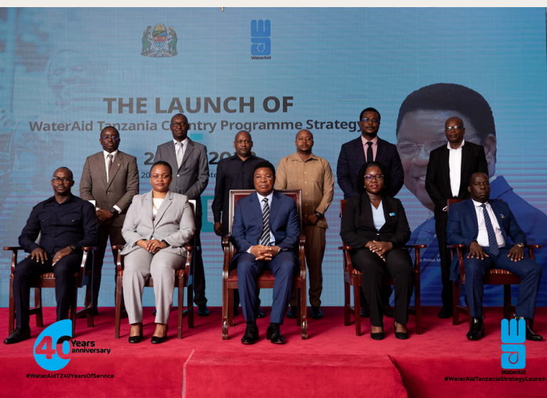
A group photo of water utilities and the Chief Guest

We would love to share all the photos with you here but you can view them all at your own time here and watch our event highlight video here