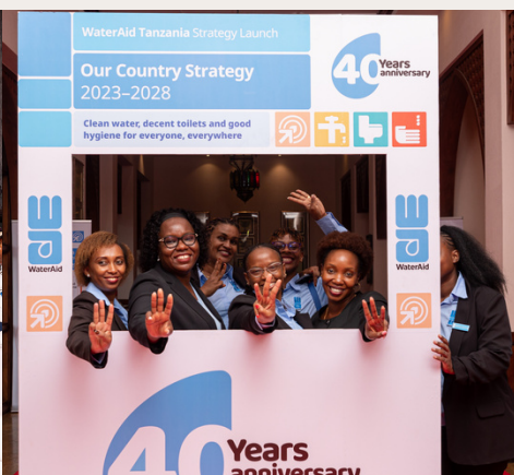
WaterAid staff posing on the WASH selfie frame