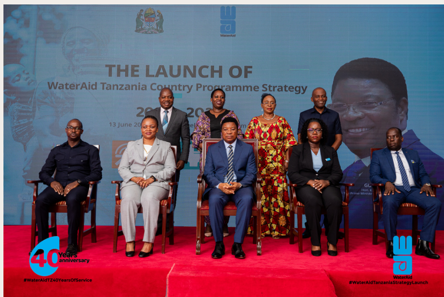
A group photo of Members of Parliament and the Chief Guest