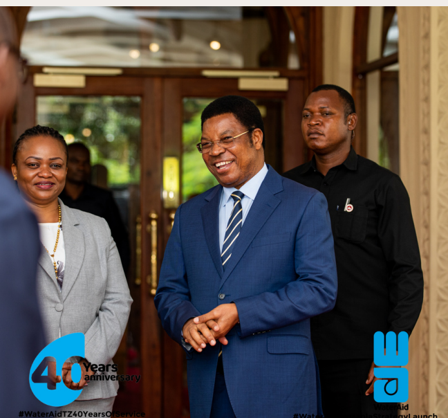
Chief Guest(right) and Deputy Minister(left) arriving at the venue before the ceremony