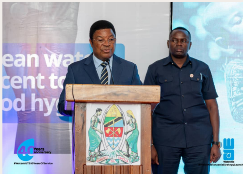
Hon. Kassim Majaliwa Majaliwa, the Prime Minister of the United Republic of Tanzania

Infectious diseases caused by lack of clean and safe water, poor sanitation in our communities, health care facilities, schools and public places remain a threat to public health and pose a significant burden on our country in treating or responding to these diseases. The World Bank's 2023 report (Tanzania Economic Update Report 2023) shows that our country is losing 5.6 trillion shillings annually due to poor access to clean water and sanitation. This amount is so high that it is equivalent to 3.2% of the gross domestic product (GDP).