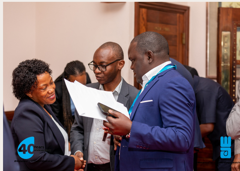
Invited guests exchanging remarks before the ceremony