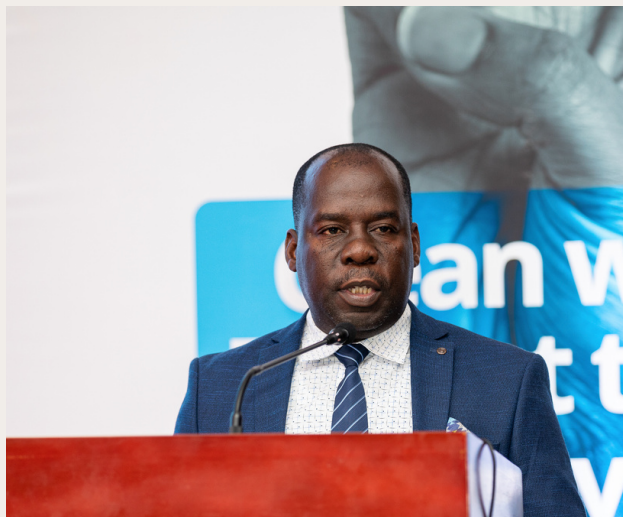
Hon. Shaibu Kaduara, Minister for Ministry of Water, Energy and Minerals - Zanzibar

I thank and commend Hon. Jumaa Aweso for their efforts in the water sector to make sure it prospers. Our cooperation has propelled a lot of development for both Tanzania and Zanzibar and for people to enjoy clean water services.