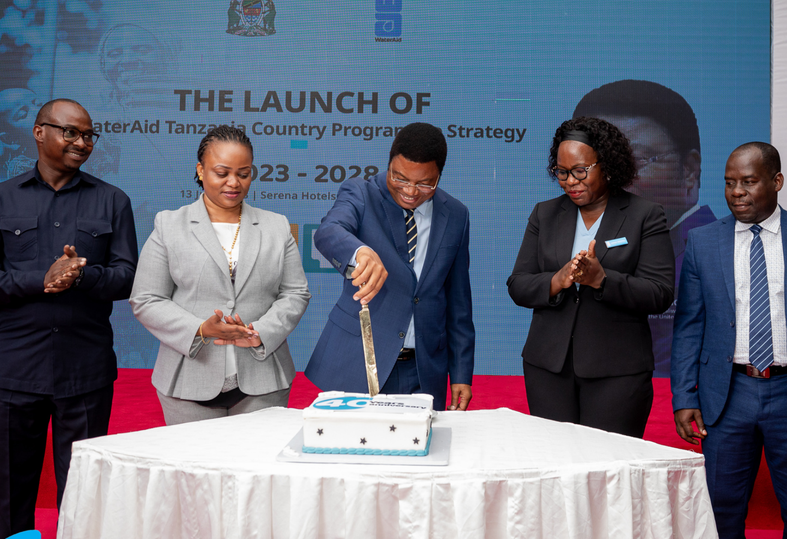
Hon. Kassim Majaliwa Majaliwa, the Prime Minister of Tanzania, cutting the 40 years anniversary cake