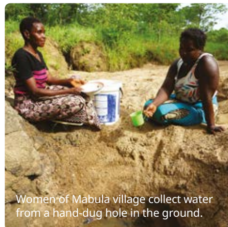
Women of Mabula village collect water from a hand-dug hole in the ground.

All age talk PowerPoint, the stories of Ruth and Ivy and the Harvest Appeal film (all available to download at wateraid.org/uk/harvest )