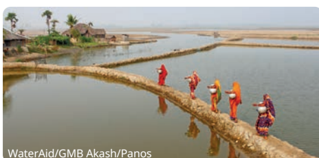
◀ Women collecting water, Moshashoripur village, Koyra, Bangladesh, 2011.