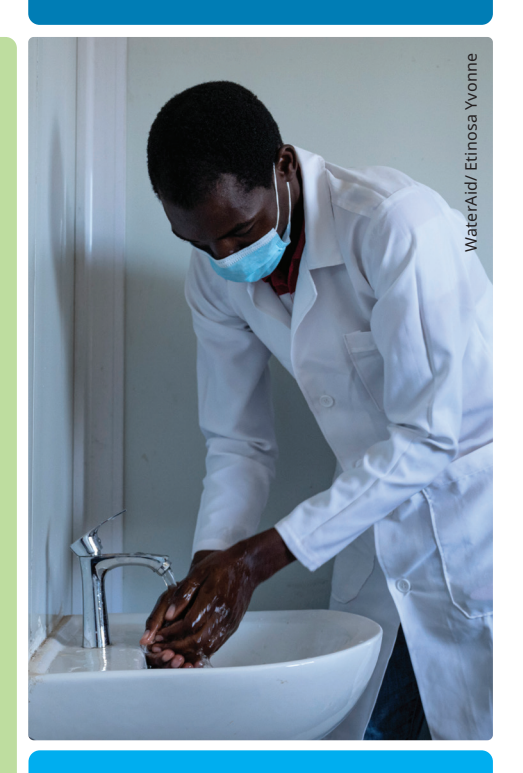
By giving a gift this Christmas, your group will help create a new normal for communities around the world.