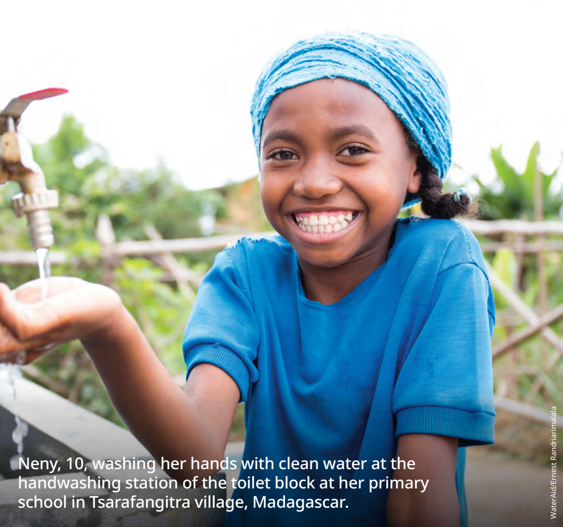
Neny, 10, washing her hands with clean water at the handwashing station of the toilet block at her primary school in Tsarafangitra village, Madagascar.