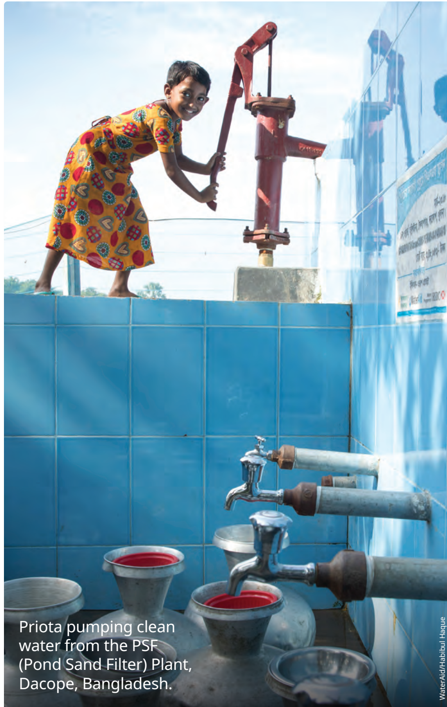
Priota pumping clean water from the PSF (Pond Sand Filter) Plant, Dacope, Bangladesh.

When you add a gift to WaterAid in your will, you can trust us to use your money carefully. We value these gifts as they are vital in reaching even more people with clean water. Your legacy could be the taps and toilets that transform communities, schools and health centres. With your gift, an entire community could be empowered to change its future, creating hope and prosperity for all.