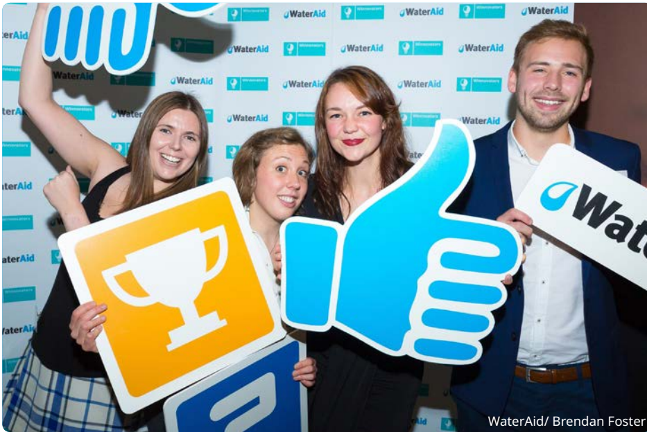
WaterAid/ Brendan Foster

It's amazing what you can achieve when you get your creative juices flowing for something that truly matters. We found the whole experience invigorating and inspiring, and wouldn't hesitate to encourage other companies to sign up now for Winnovators 2018, with its focus country of India."