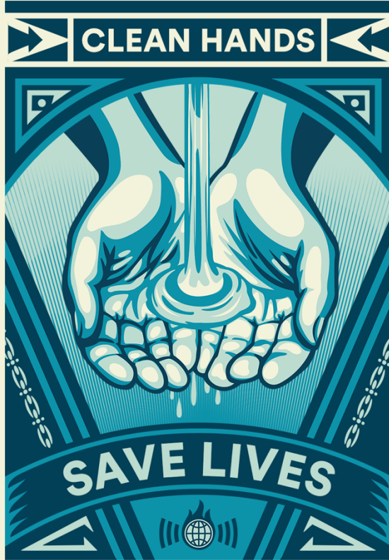
Clean Hands Saves Lives by Studio Fizz