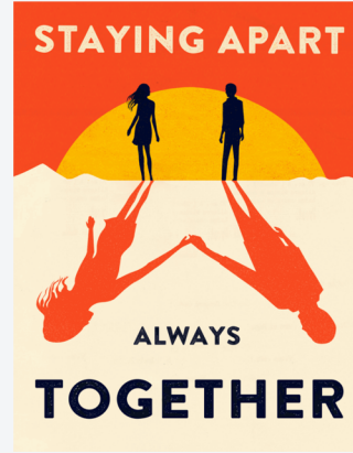
"Always Together" by Holy Moly UK