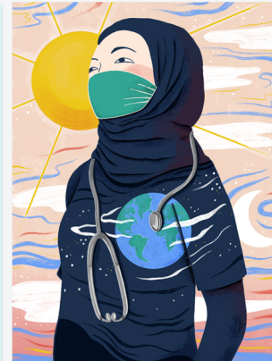
"First Responder" by Coco Senderling