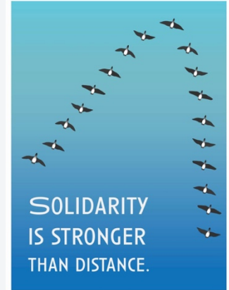
"Solidarity is stronger" by Radical Emprints