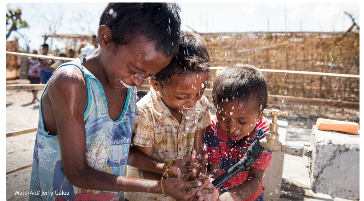
● Children use a new water point in Timor Leste.