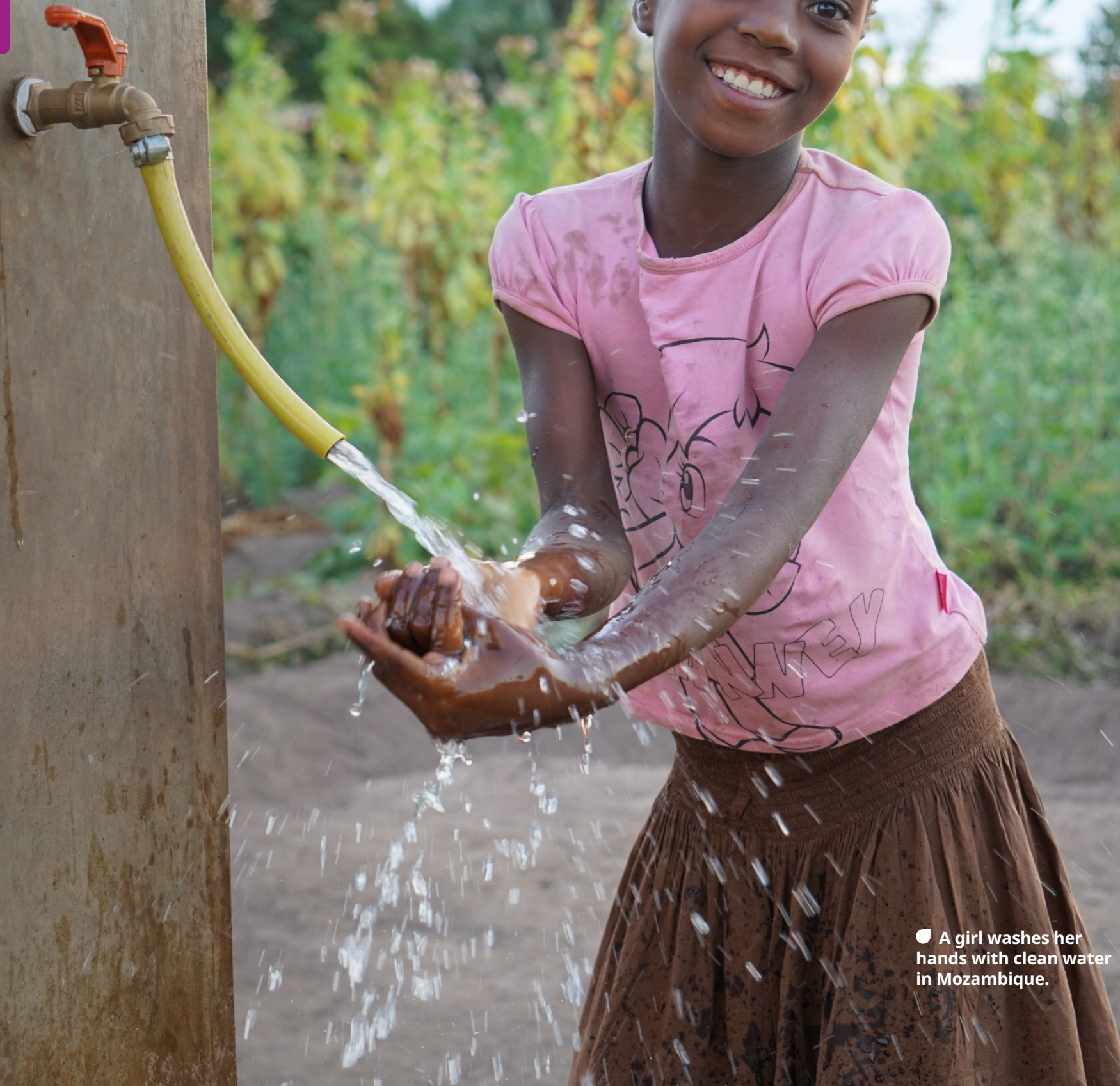
● A girl washes her hands with clean water in Mozambique.