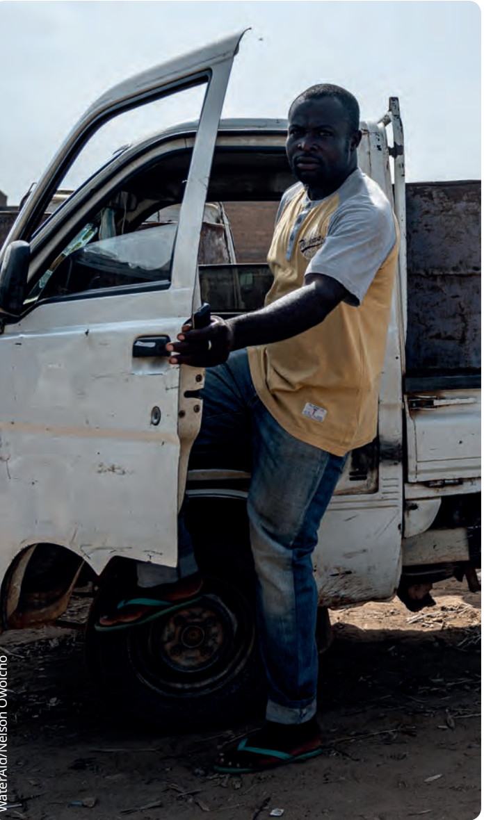
Sanitation workers: The forgotten frontline heroes during the COVID-19 pandemic / 19