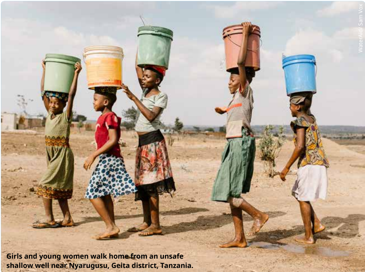
Girls and young women walk home from an unsafe shallow well near Nyarugusu, Geita district, Tanzania.

As this year's report demonstrates, wherever you are in the world, it's the poorest and least powerful who are most often without clean water. That means those who are older, ill, disabled, who live in a remote or rural location or have been displaced, or who are of a caste, ethnicity or religion likely to be discriminated against. Inequalities in wealth and power, attitudes in society and culture, and limited resources mean they are also hardest to reach. Gender intensifies this inequality; it is mainly up to women and girls to find and fetch water, or to find ways to adapt when it is scarce. Consider this: a woman collecting the UN-recommended amount of 50 litres per person for her family of four from a water source 30 minutes away would spend two and a half months a year on this task.