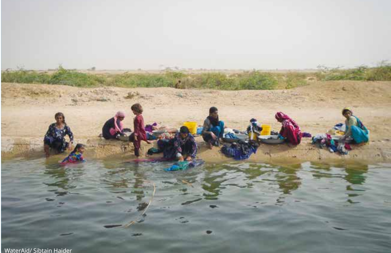
Women wash clothes at a stream in the village of Noor Muhammad Thaheem, Thatta, Sindh, Pakistan.