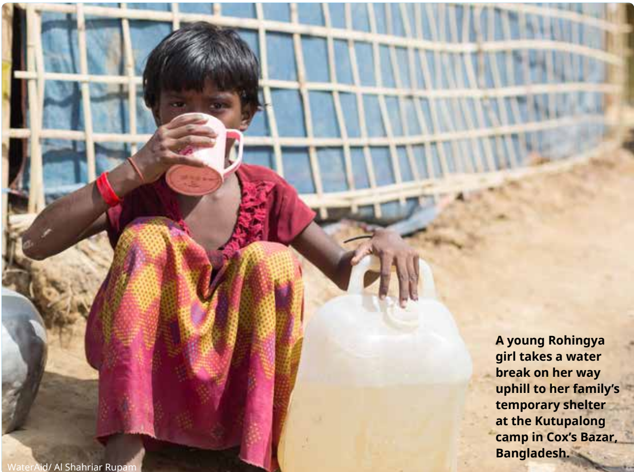
A young Rohingya girl takes a water break on her way uphill to her family’s temporary shelter at the Kutupalong camp in Cox’s Bazar, Bangladesh.

This summer’s review of Global Goal 6 will show that progress is not happening fast enough, and the task of reaching everyone with clean water is growing more difficult. Business as usual cannot create the change that is needed.