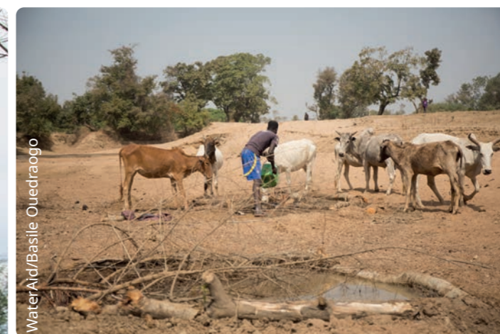
● A stock breeder watering cows and oxen in a partially dried riverbed crossing. Sablogo, Burkina Faso. January 2018.