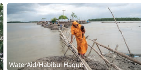
● Kalabogi village is situated in the Sutarkhali Union at Dacop Upazila. As a coastal region, it is susceptible to climate-induced natural disasters such as a cyclones, floods, tidal surges and sea-level rises. Dacop, Khulna, Bangladesh. August 2020.